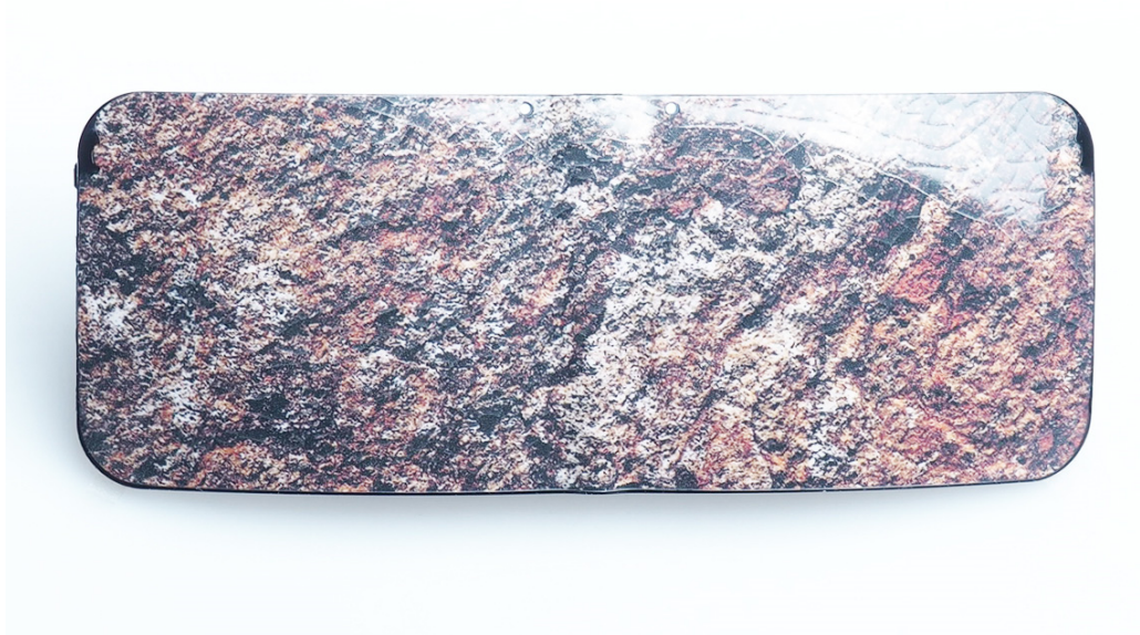
Caption: IMPLEX preform based on TROGAMID®.

product expertise, while Tungfung serves as an expert partner in the production of exceptional eyeglasses frames.