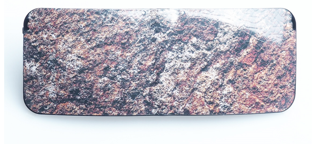
Caption: IMPLEX preform based on TROGAMID®.

product expertise, while Tungfung serves as an expert partner in the production of exceptional eyeglasses frames.